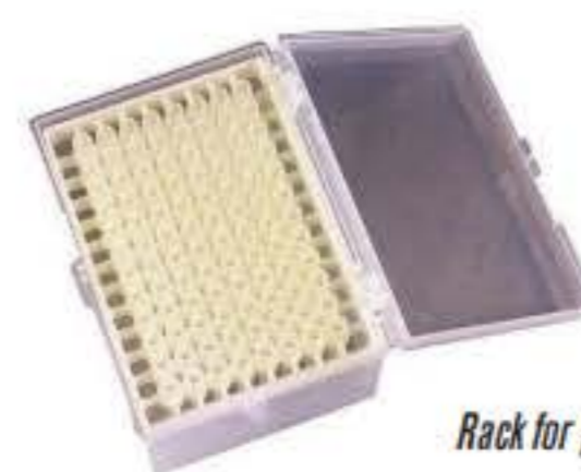
Rack for pipette tips.