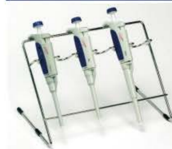
Pipette rack. Made of AISI 304 stainless steel. No. of places: 6 dosing pipettes up to 28 cm in length. Part No. 1001215