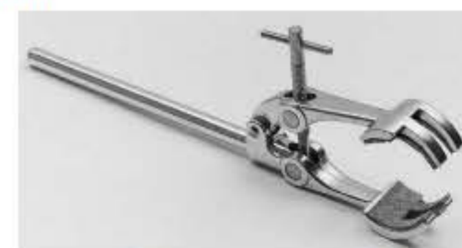
Clamp for flasks or condenser tubes. Part No. 7000403