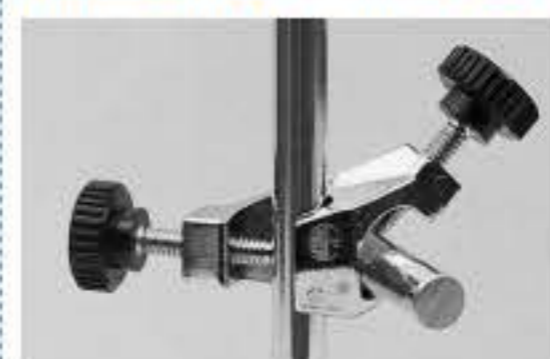
Boss head for supporting clamps. Part No. 1000069