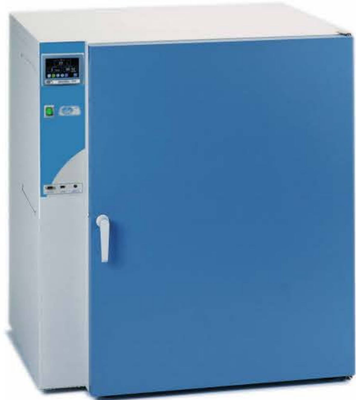
Model Part No. 2000238.

STANDARD EQUIPMENT For Part No. 2000238, 2 shelves and 4 shelf guides. For Part No. 2000239 and 2000240, 2 shelves.