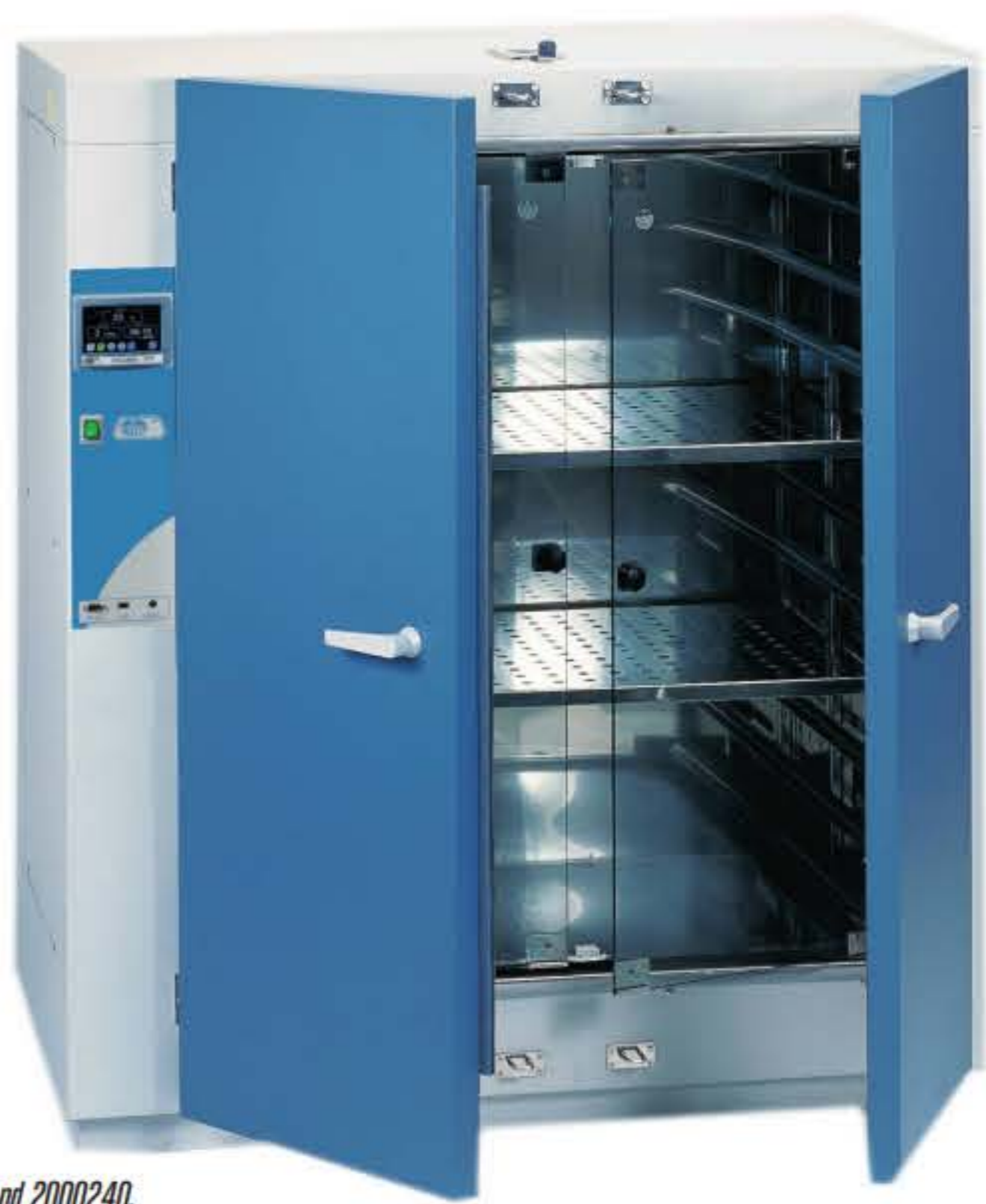
Models Part No. 2000239 and 2000240.

Note: To obtain the optimum homogeneity at the set temperature, the load should not surpass more than 70 % of the volume of the chamber.