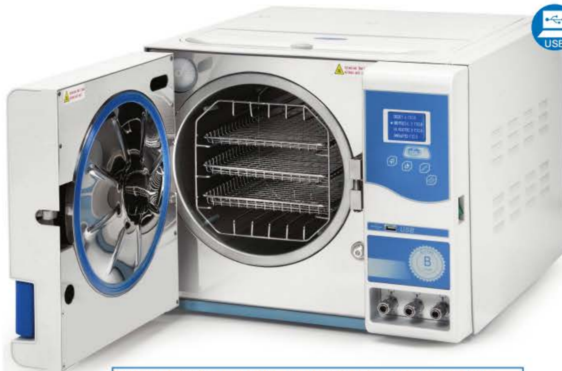
TEMPERATURE CONTROL AND AUTOMATIC MICROPROCESSOR CYCLE.