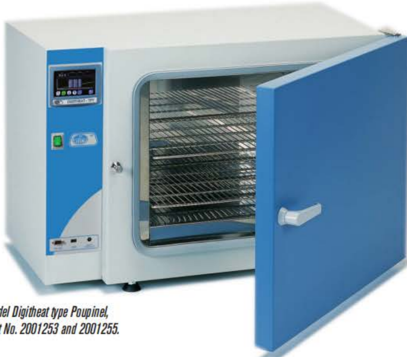
Model Digitheat type Poupinel, Part No. 2001253 and 2001255.