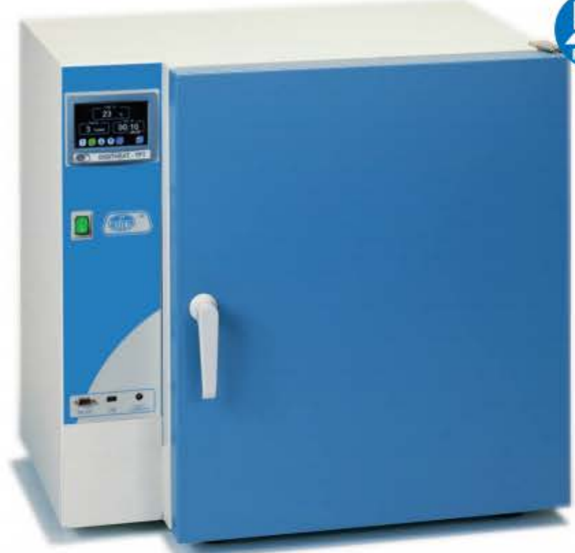
Model Digitheat, Part No. 2001251, 2001252 and 2001254.